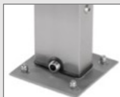
Connection at the rear base.

Shower QUARTZ is delivered with the possibility of making the connections either to the rear base or from below. Shower QUARTZ is delivered with 4 studs in stainless steel (Ø 10 mm, length 96 mm).