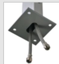
Connections from below