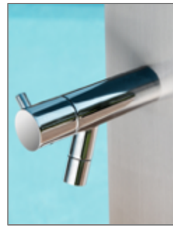
Foot wash faucet