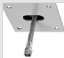
Connection from below