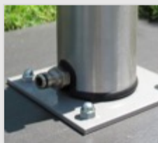
Connection at the rear base.

Borne RONDE is delivered with 4 studs in stainless steel ( \varnothing 10 mm, length 96 mm).