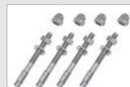
4 studs in stainless steel