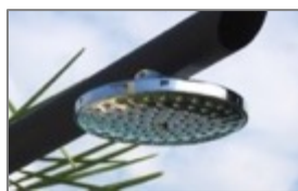
Ø 20 cm