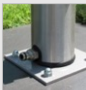
Connection at the rear base.

Shower ROUND is delivered with 4 studs in stainless steel (Ø 10 mm, length 96 mm).