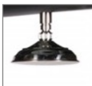
Ø 15 cm