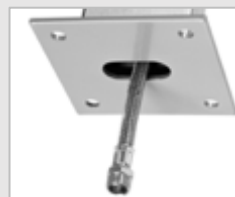
Connection from below