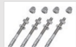
Studs in stainless steel (1 set of 5 units)