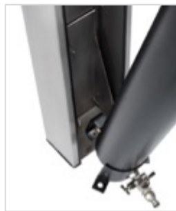
Fitting of the tank