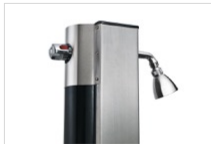
Thermostatic faucet at the top of the tank