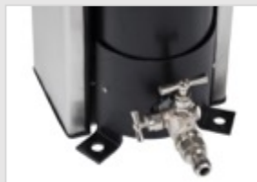
Connection at the rear base

Imperative installation on a concrete slab.