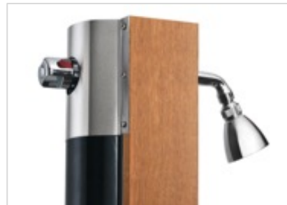
Thermostatic faucet at the top of the tank