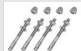
Studs in stainless steel (1 set of 5 units)