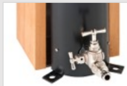
Connection at the rear base

Imperative installation on a concrete slab.