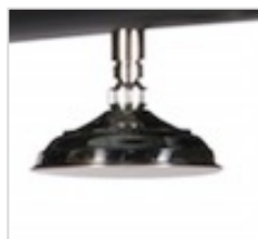
Ø 15 cm